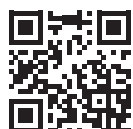
PROBE AND PROBE HANDLER