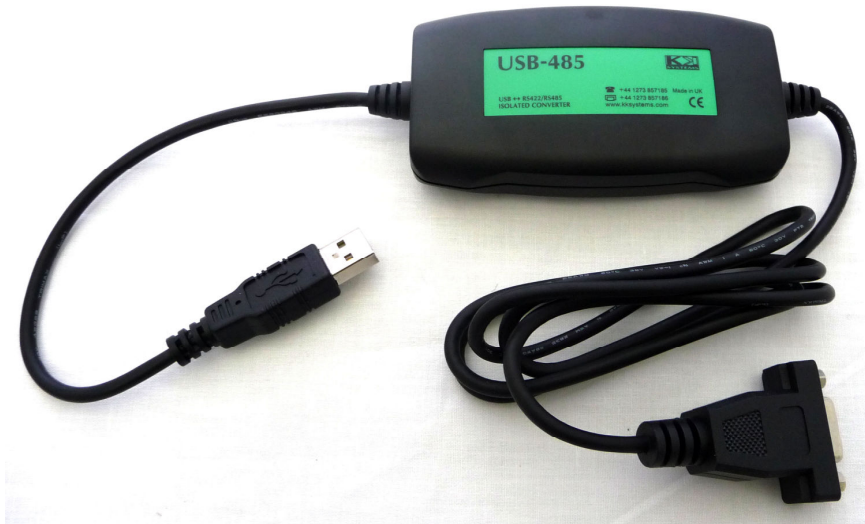
Fig 1. RS-422 to USB Converter Module (USB-485)

The converter is labelled as a USB-485 converter but is suitable for RS-422 use as the RS-485 standard is written to be electrically compatible with RS-422.