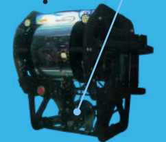
PROBE HANDLER G1 (optional)