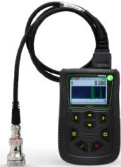
CYGNUS 6+ PRO