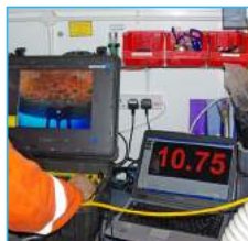
SURFACE DISPLAY OF MEASUREMENTS