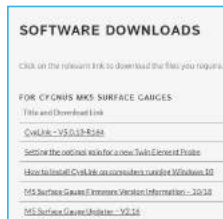
DOWNLOAD FROM OUR WEBSITE