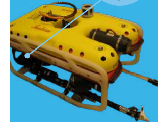
PROBE HANDLER W1 (optional)