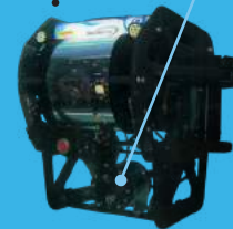
PROBE HANDLER S1 (optional)