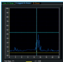
A-SCANS ANALYSIS CAPABILITY