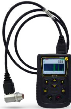
CYGNUS 4+ GENERAL PURPOSE