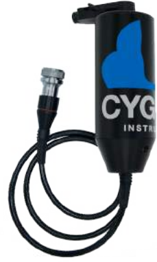
CYGNUS MINI ROV MOUNTABLE