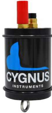
CYGNUS ROV MOUNTABLE